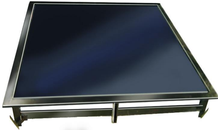
With Foundation Frame